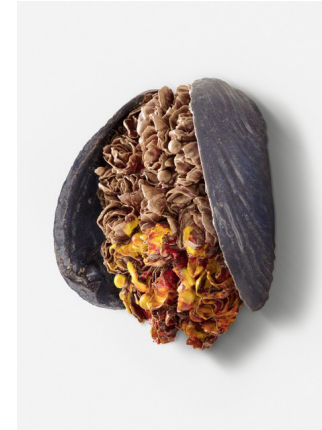
Almine Rech Gallery Johan Creten Wild Heart Closed, 2018 Glazed stoneware 36 x 43 x 20 cm